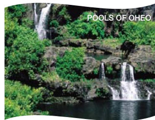
POOLS OF OHEO