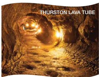
THURSTON LAVA TUBE