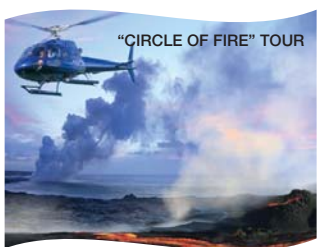
"CIRCLE OF FIRE" TOUR