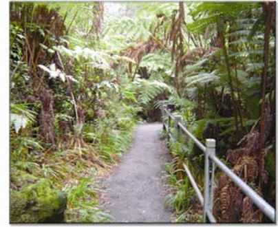
Thurston Lava Tube