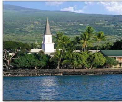
View of Kona Harbor