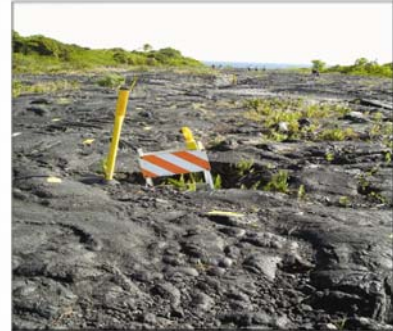
Walk over Recent Lava Flow