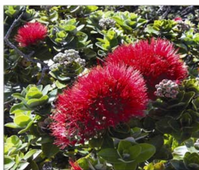
Ohia Lehua Blossoms