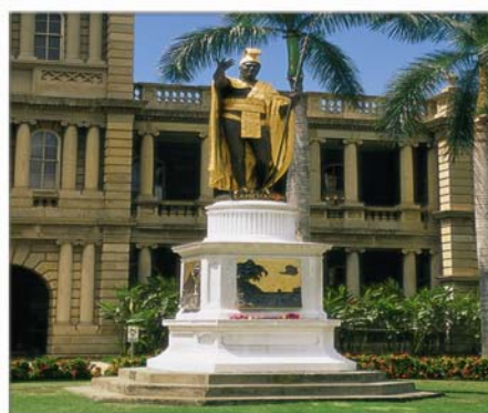
Statue of King Kamehameha