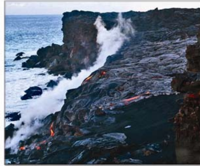
Lava into Sea at End of the Road