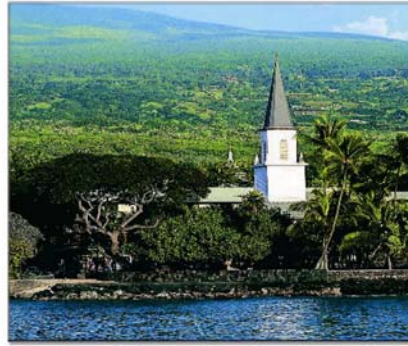
Historic Kona Town