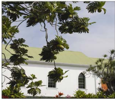
St. Benedict's "Painted Church"