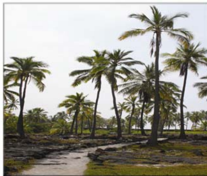
Pu'uhonua 'o Honaunau "Place of Refuge"