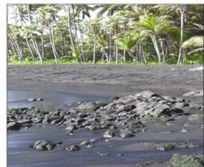
Punaluu Black Sand Beach