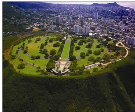
Punchbowl National Cemetery