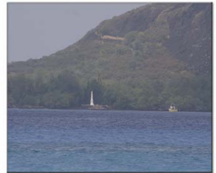
View of Kealahou Bay