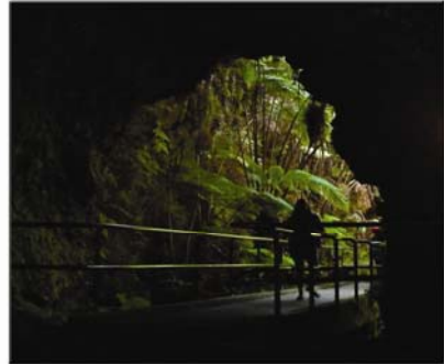
Thurston Lava Tube