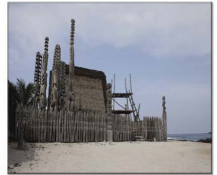
Pu'uhonua 'o Honaunau