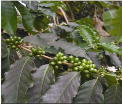
World Famous Kona Coffee Farm