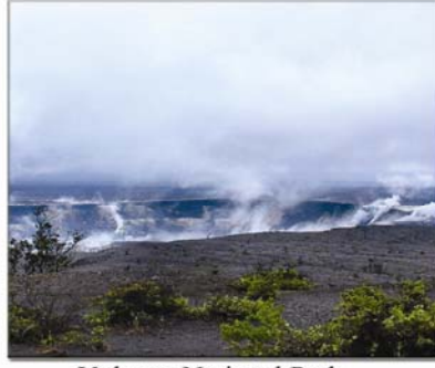
Volcano National Park