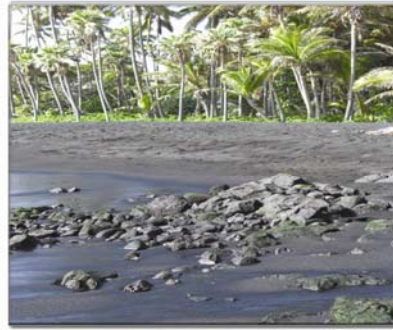
Punaluu Black Sand Beach