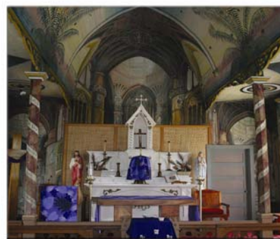
Inside St. Benedict's "Painted Church"